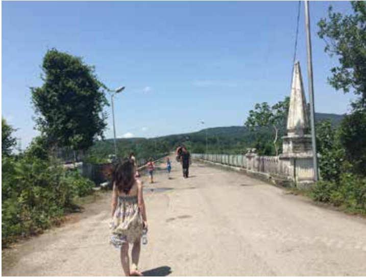
The Enguri bridge

Gali can obtain Abkhaz passports only through naturalization, and the procedure is discriminatory, arduous, and arbitrary. The process comes with the additional emotional burden of renouncing their Georgian citizenship, and doing so with a hand-written declaration that is considered invalid by the Georgian state.