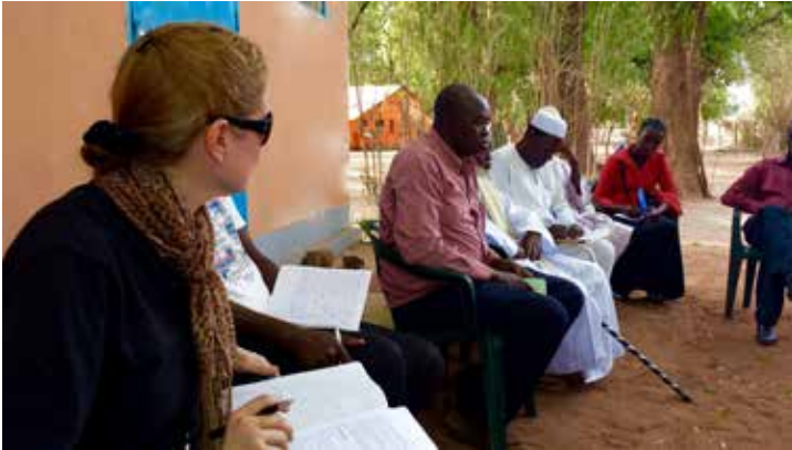
As focus group discussions with religious leaders in Southern Chad confirm, religious identity is one of many factors framing the experience of displacement for Central African refugees.

Accustomed to the amenities of urban life, many of the refugees felt that returning to danger was preferable to doing nothing. “There’s nothing here. No TV, no music, no way to advance my education, nothing ... Despite the risk I’d rather return home [to Bangui, CAR’s capital] if I can find anything to do there,” offered a despondent teen-aged male who had been forced to flee with his family before completing his last academic year in high school. Several male youth pointed out that there was money to be made by joining the Séléka militias, whose members receive a modest salary—a reality that was corroborated with alarm by Chadian security authorities and aid workers. Some of these young refugees admitted being attracted by the financial gains of joining armed groups, irrespective of ideological, political, or religious convictions.