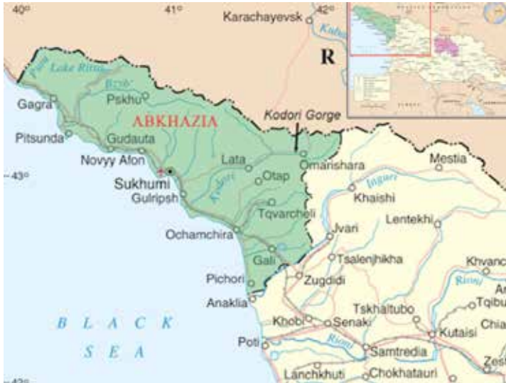
Map of Abkhazia and northwestern Georgia. Note the towns of Gali and Zugdidi across the border from each other at about the center of the map.

The case of Georgian returnees constitutes one of the driving forces behind sovereignty projects of Georgia and Abkhazia to control territory and people. While the Georgian state encourages Georgian presence in Abkhazia to underwrite its claims to the lost lands, the Abkhaz authorities aim to limit the number of ethnic Georgians in the region through arbitrary barriers to their movement and rights. Under these conflicting state projects, mobility from both sides takes shape in convoluted and unexpected forms, primarily through registered and unregistered crossings across the administrative borderline. Displaced Georgians who do not have “proper” documents cross the border either on foot or by swimming across the Enguri river “illegally.” In fact, “legality” is under question in the region because of shifting regulations and arbitrary enforcement. Georgian residents of Gali have to possess passports of the “unrecognized” Abkhaz state, obtain identity documents known as Form N9, or validate their old Soviet passports with an Abkhaz stamp in order to “legally” cross the border. Abkhaz authorities consider the internal Abkhaz passport as a documentation of citizenship and require all residents to obtain passports as a condition for certain rights such as to vote, to buy property, and to commute freely across the administrative borderline. Ethnic Georgians in