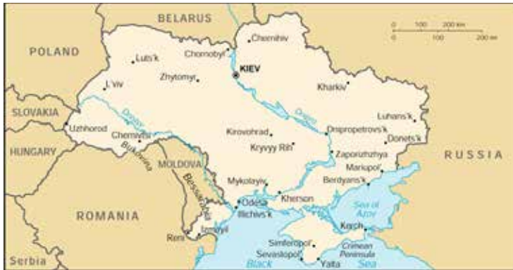
Map of Ukraine with Donetsk and Luhansk to the east and Crimea to the south.

Some interpretations of this conflict misleadingly reduce it to a confrontation between Ukrainians with different political perspectives: those who support a closer political affiliation with Russia and those who stand for closer ties to the European Union. The fact that the population of Donbass (which includes both Donetsk and Luhansk regions) has strong social and historical ties with Russia adds to the sharpening of the line that divides Eastern Ukrainians from pro-European populations. Indeed, during the reconstruction of the Donbass region after World War II and Soviet industrialization, many Russians arrived in Donbass for coal mining and heavy industry employment, which shaped the region's identity. These regional identities pose challenges for displaced people from the Donbass region, as they are labeled as “Russians” or “separatists” regardless of their political views.