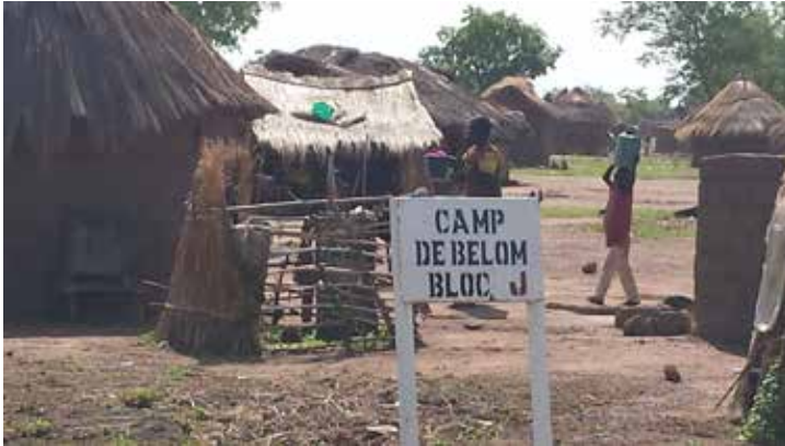
Belom Camp, near Maro in the Moyen Chari region of Chad, houses mainly long-term refugees from the Central African Republic.

authorities and international experts share a concern that villages along the border and refugee camps may become breeding grounds for further violence and radicalization.