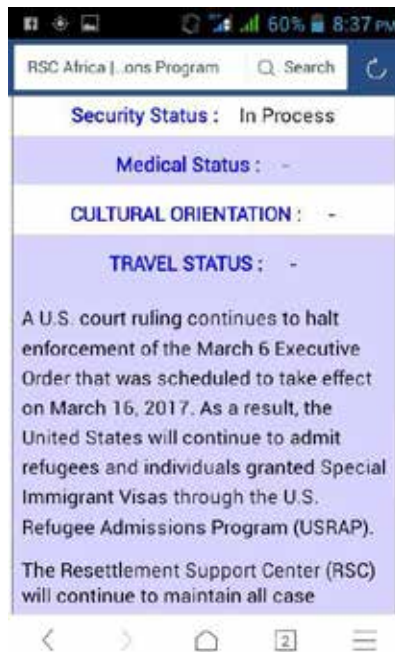
Screenshot of travel status update after the Federal Appeals Court ruling in May 2017. Refugees currently within the resettlement program can check their status on the Resettlement Support Center (RSC) website.

June 26: Supreme Court partially reinstates the second travel ban.